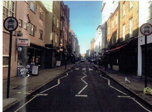
Red Lion Street WC1